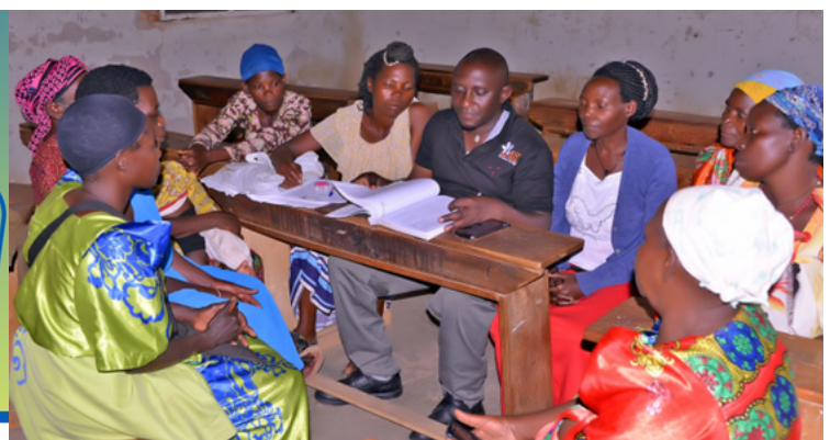
Initiative For Mtoto Wa Shule; IMS, Field Co-ordinator For Kyotera District orienting members of Kisubi PEIS how to use Cash books in recording their Savings