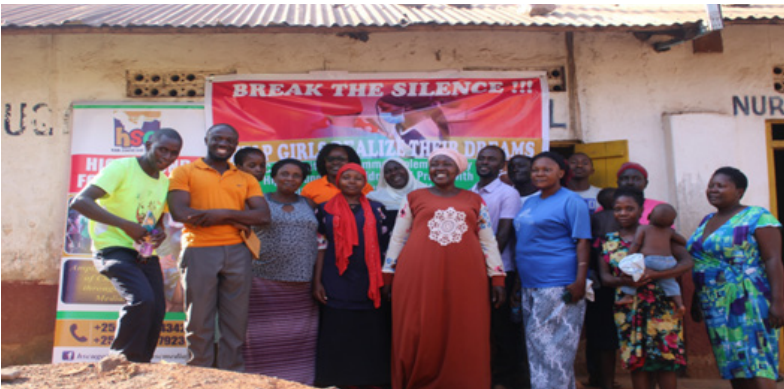
HIGH SOUND FOR CHILDREN - HSC Community Leaders after the Dialogue; under the Break the Silence programme