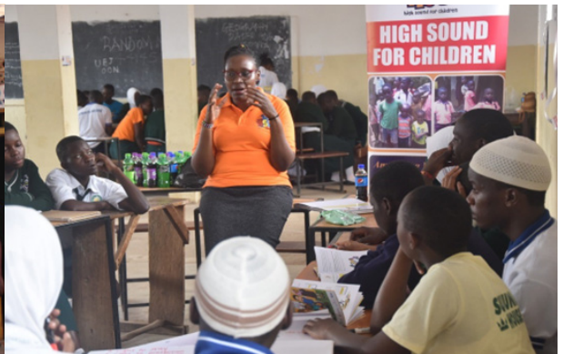
School Engagement at Kingstone High School