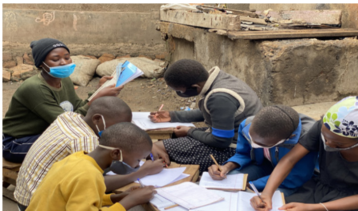
A peer led catch up Community Group of out of school children undergoing literacy lessons in Kifumbira slums; Kampala City.