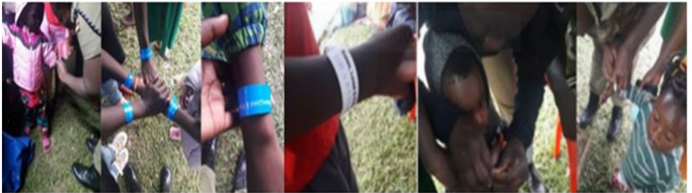
A team from Compassion International worked together with the Child and Family Protection Unit of the Uganda Police Force to handle Safety and Protection of children during the National Martyrs' day celebrations in June 2022.