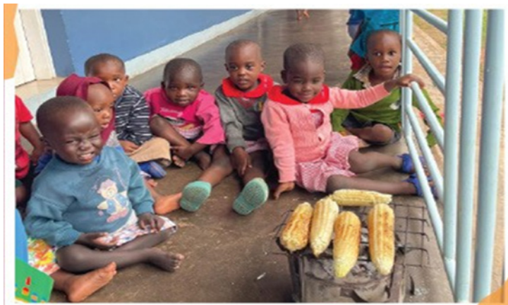
"We are ready to eat home grown maize"