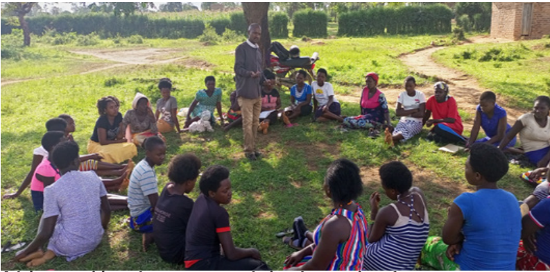
Adolescent girls and young women during the creation of awareness on dangers of child marriage and teenage pregnancy (CHILD AID UGANDA)