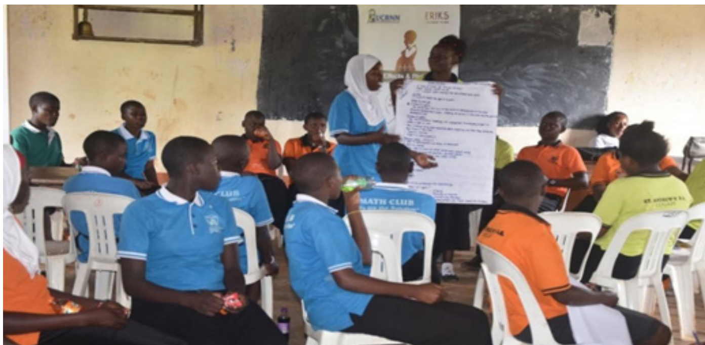
A child at St. Andrew's Sec School in Lugazi town explains to her peers what they had learnt from the trainings on children's rights and how to access justice.(Mukono District)