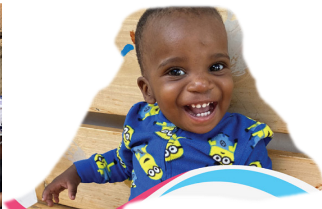
Protecting the children at Sanyu Babies Home, Kampala; "We smile"