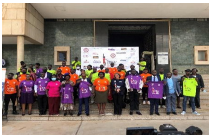
Journey of Hope participants during the flag off event at the Parliament of Uganda.