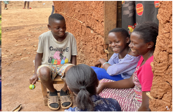
IMS Programme Officer engaging children and their parents